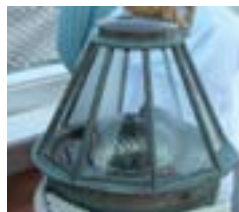
Ship's compass on the Schooner Lannon