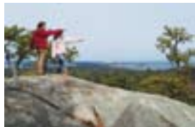
The view from Red Rock